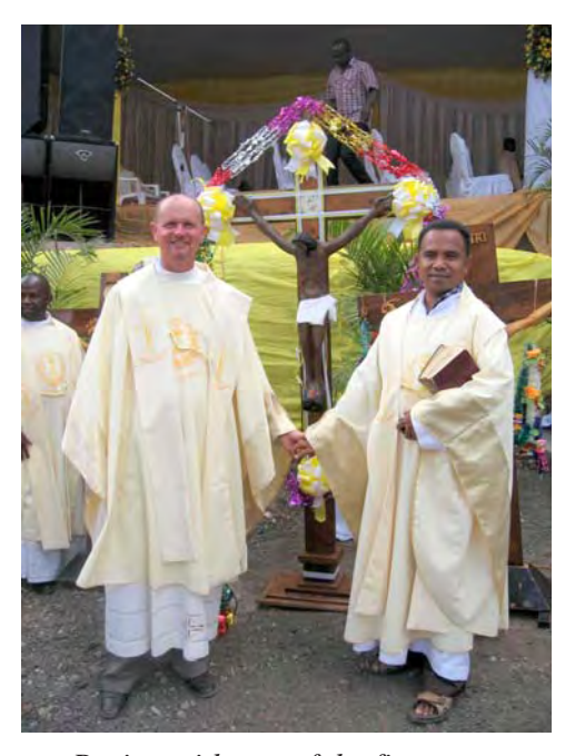
Posing with one of the five crosses

On following day, Sunday 29 Dec 2013, the climax of the Golden Jubilee of the Archdiocese of Arusha was celebrated. Thousands of Christians gathered for the occasion together with 20 bishops and scores of priests and religious. The five crosses which over the past two and a half years had been carried through all the outstations in the parishes of the five deaneries were given out to one parish each which ought to become a place of pilgrimage.