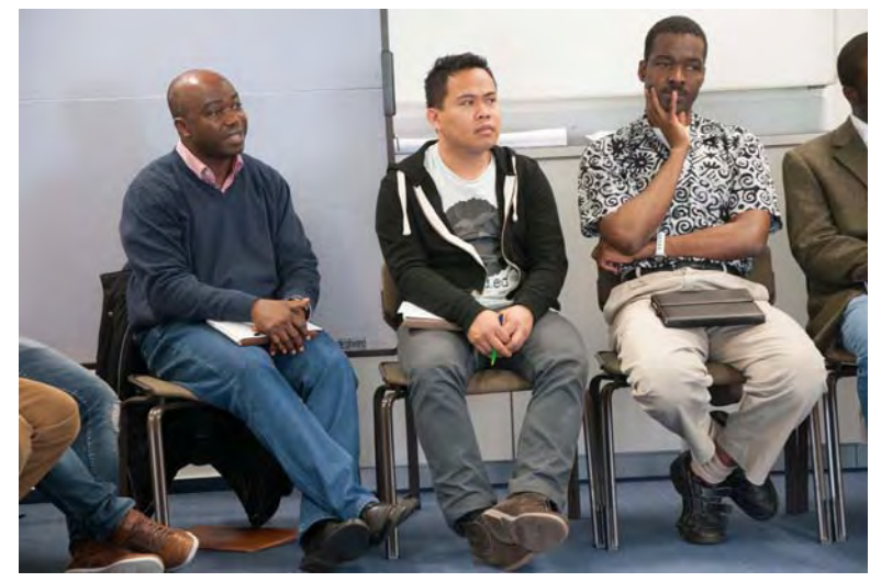
Participants challenged by new evangelization

enthusiasm. Times were set aside for prayer and worship in common. Returning to one's roots in faith and sharing faith experiences were important for the group. The meeting also included discussions with the provincial leadership to get an idea of the