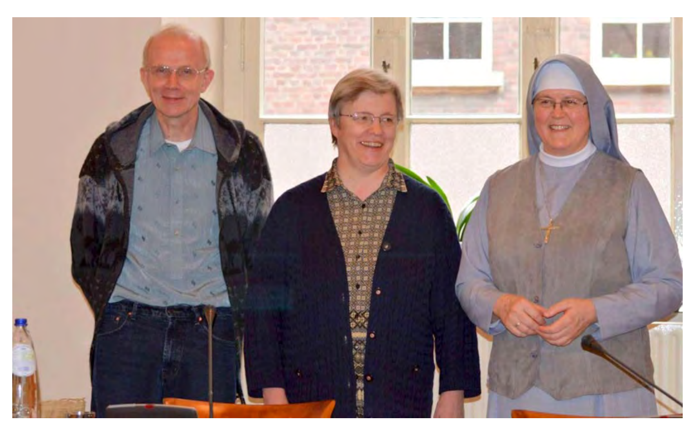
Leaders of the three congregations at the General Chapter of the SSpS