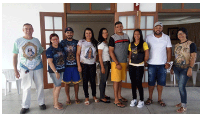
SVD lay associates committed to the Church

Every year students from UPeCe and SVD priests visit Oies to pray to St. Joseph Freinademetz, the patron saint of the University Pastoral Center in Bratislava since its beginning in 1997. Daily, hundreds of young people come to this Center to participate in Masses and activities to build mutual relationships and to experience spiritual growth.