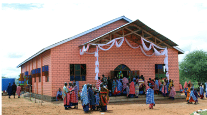
The Church built by the contributions of the people themselves.

been built by the contributions of the people themselves, the majority of whom are nomadic pastoralists. The Catholic Church has been present in this area for the last 50 years yet the evangelization is still regarded as primary. During the last 16 years of the presence of the SVDs, many steps have been made toward the growth of the faith. The biggest challenges are illiteracy and poverty.