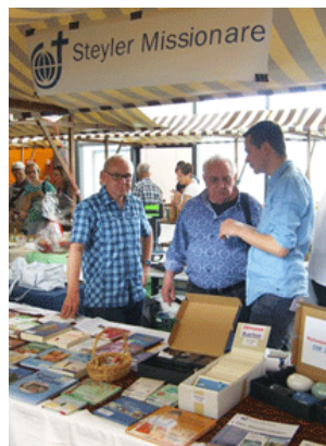
The SVD presented its mission magazines, calendars, and books.

Already for the thirteenth time, the "Monastery Fair" took place in the Swiss town of Gosau. The SVD was again present with a booth. While the classic "monasteries" were present with food, the SVD presented its mission magazines, calendars, and books as well as some other products such as hanging angels for the car. A chart in the booth explained who the Divine Word Missionaries are