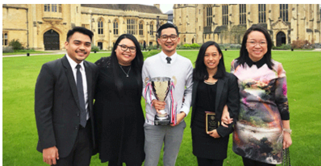
The USCCL Mooting Team Team

The University of San Carlos College of Law (USCCL) Mooting Team dominated in the recently concluded 2018 Price Media Law Moot Court Competition held in Oxford University, Oxford, United Kingdom from April 9-13, 2018. The team faced off against the defending champion, Singapore Management University, in the championship round. The Finals Bench was composed of five (5) international judges, including sitting judges of the European Court of Human Rights and the International Tribunal for the Law of the Sea. Other members of the judging panel were