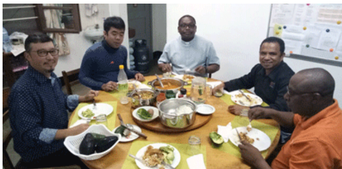
Our confreres savoring the avocado fruit.