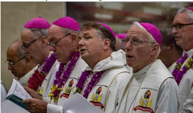
The SVD bishops at the Assembly were Archbishop Douglas Young, SVD of Mount Hagen and Bishop Josef Roszynski, SVD of Wewak.

The Federation of the Catholic Bishops of Conferences of Oceania (FCBCO) consists of the four Conferences of: 1. Australia (ACBC), 2. New Zealand (NZCBC), 3. Papua New Guinea and Solomon Islands (CBC-PNGSI), and 4. Episcopal Conference of the Pacific (17 other small countries and dioceses of the Pacific- CEPAC). The Bishops, Apostolic Nuncios and General Secretaries of these four Conferences assemble together every four years. This year the Assembly was held 11-17 April 2018 in Port Moresby, Papua New Guinea. Eighty one participants, including seventy five bishops, participated in this six-day Assembly.