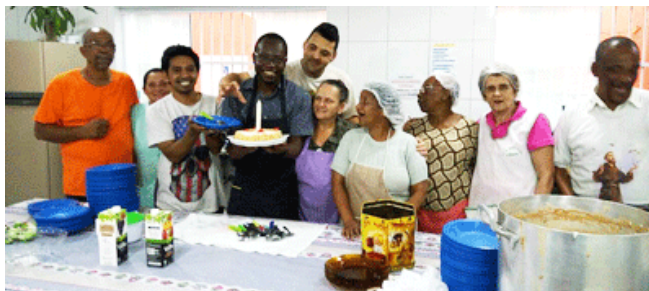
I admire the women who cook for those in need.