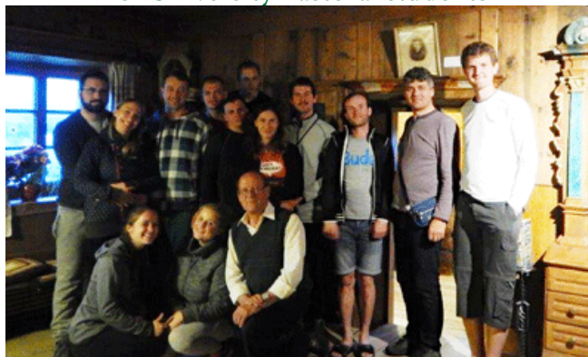
Pastoral students in a pilgrimage to Oies.